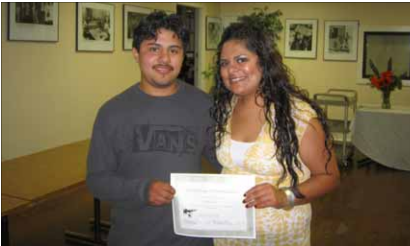
Youth celebrate at an El Centro de la Raza community graduation ceremony honoring graduates from Chief Sealth, Garfield, Cleveland and Ballard high schools and Denny Middle School.