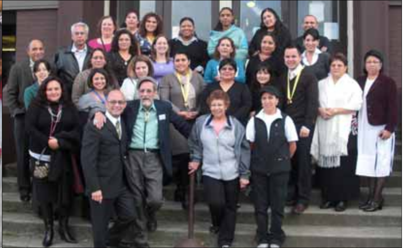
As a Family Strengthening Award winner, the child development center hosted National Council of La Raza affiliates from around the country to showcase their best practices as a national model.