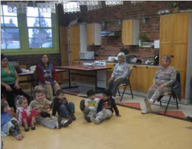
Participants in the Senior Nutrition & Wellness program exercise three times per week and students from the early learning program joined them on this occasion!