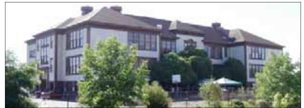
Built in early 1900, the former Beacon Hill School was abandoned in 1968 and became El Centro de la Raza on October 11, 1972 after a peaceful three-month community occupation.