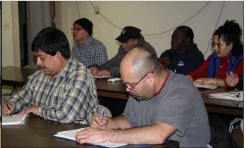
Citizenship program participants study for the naturalization test twice per week at classes during the day or in the evening.