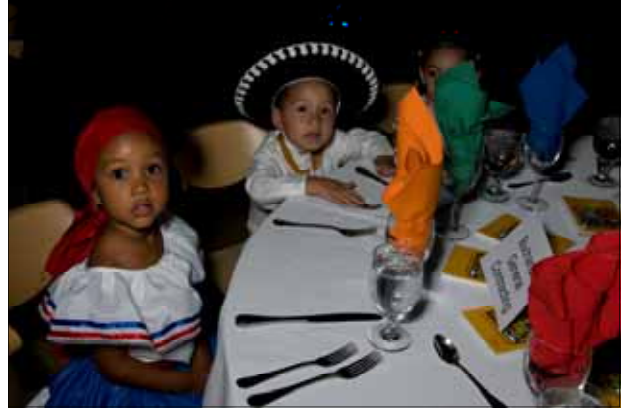
Students performed poetry and a cultural procession during the auction.