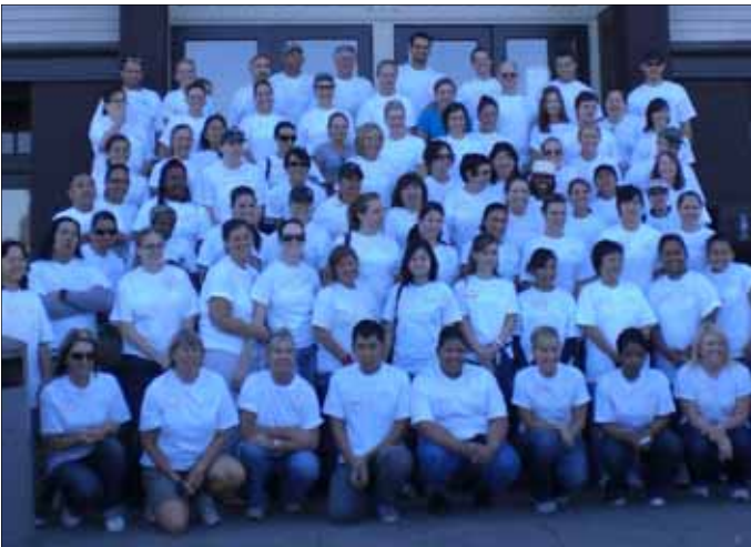
Over 130 volunteers participated in volunteer projects at El Centro for the United Way Day of Caring, including four groups from Nordstrom!