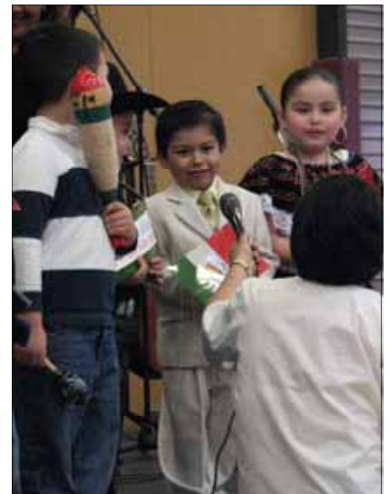
Children lead the cultural fashion show on Cinco de Mayo.