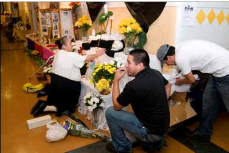
1,700 students, families and community members viewed the ofrendas/altars at our Día de los Muertos exhibit and opening ceremony at El Centro de la Raza.