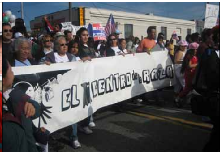
Participants, volunteers, staff and supporters march and rally for immigration and worker rights on May Day.