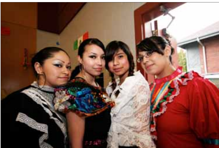
Ready to perform for 700 guests at our annual Cinco de Mayo celebration.