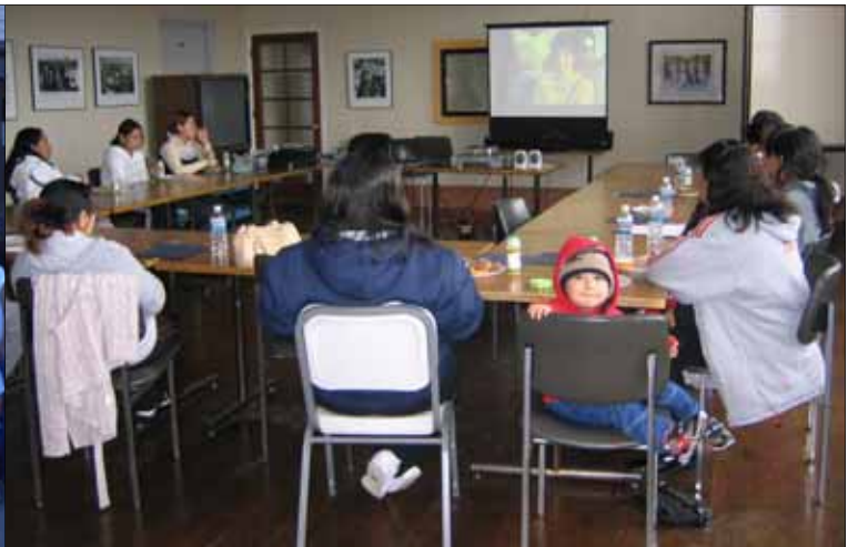
The Infant Mortality Prevention program provides advocacy, access and assistance through outreach and workshops to reduce the risk of infant mortality and increase the health of both woman and child.