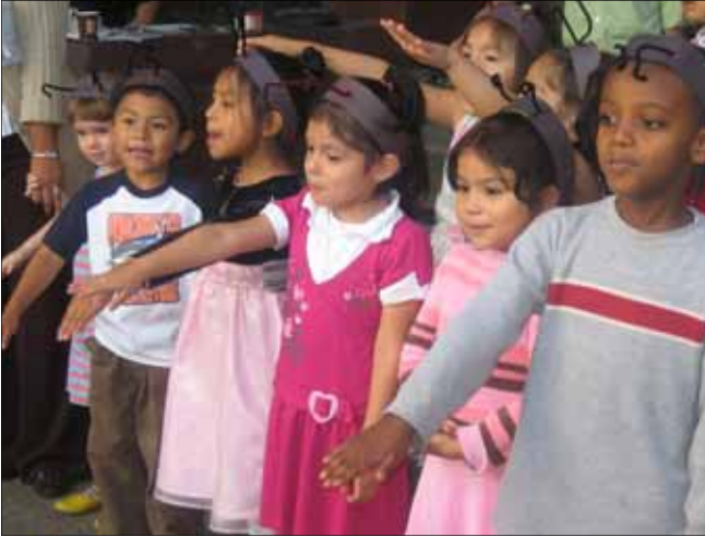
54 children in our early learning program celebrated moving on to kindergarten at a graduation ceremony organized by parents and teachers.